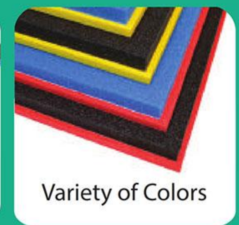
Variety of Colors

The foam inserts can be customized according to customers' application and do not come with the universal cases.