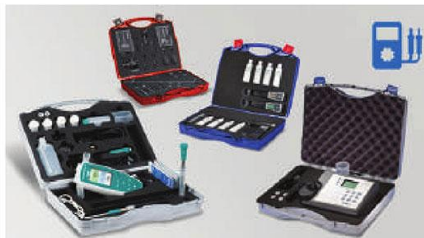
Electronic and Precision Instrument