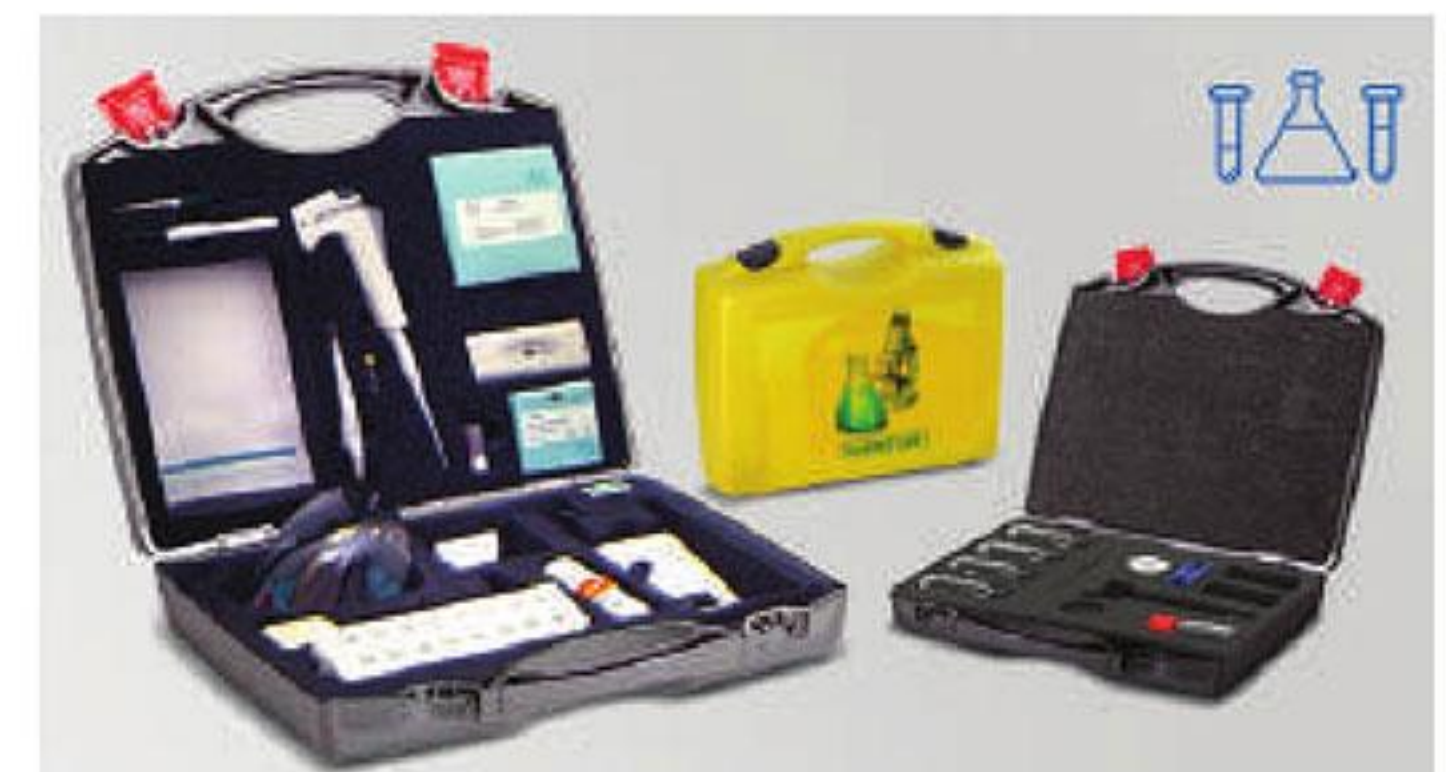
Laboratory Equipment and Chemicals