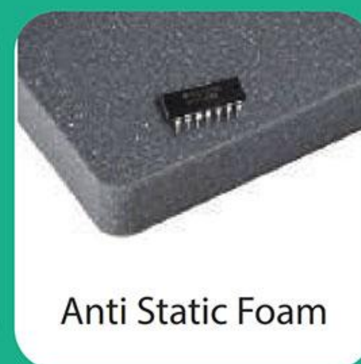
Anti Static Foam