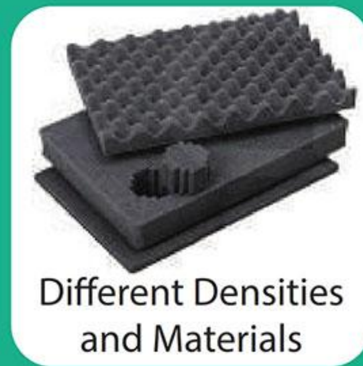
Different Densities and Materials