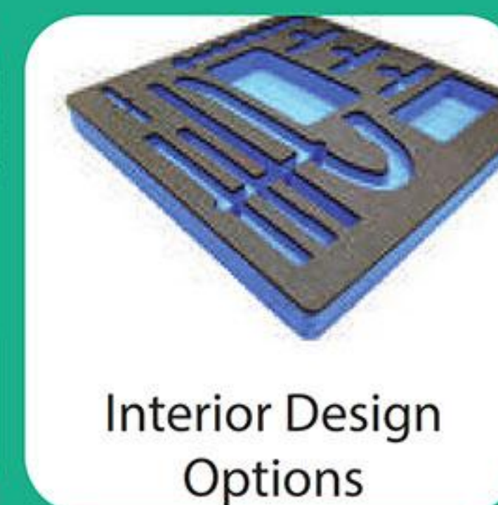
Interior Design Options