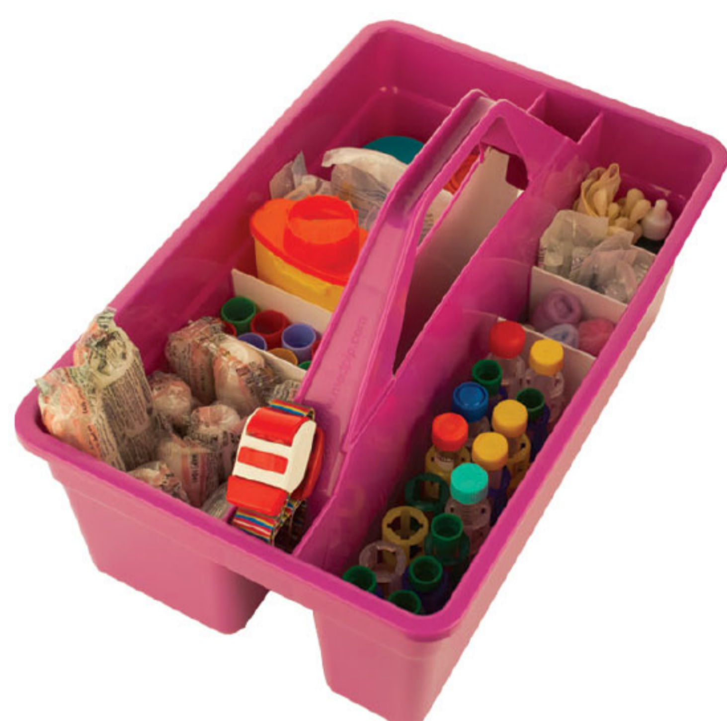
Phlebotomy Tray (page 72)