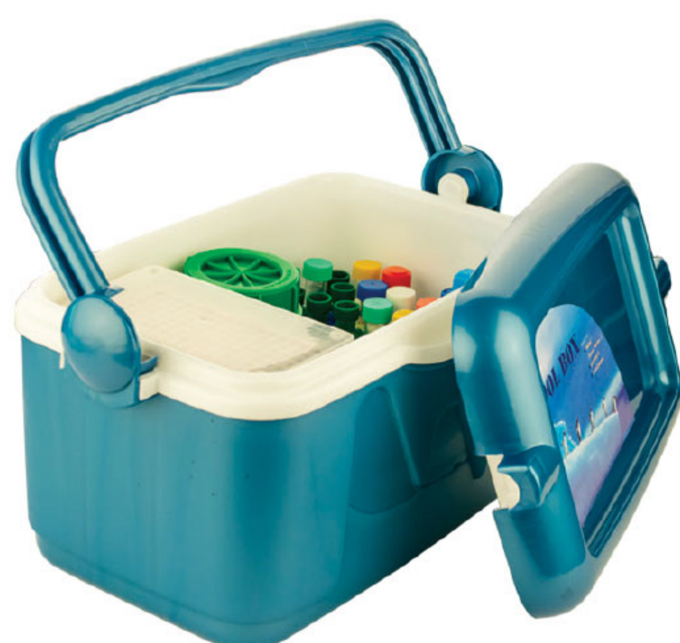
Cool Box (page 70)