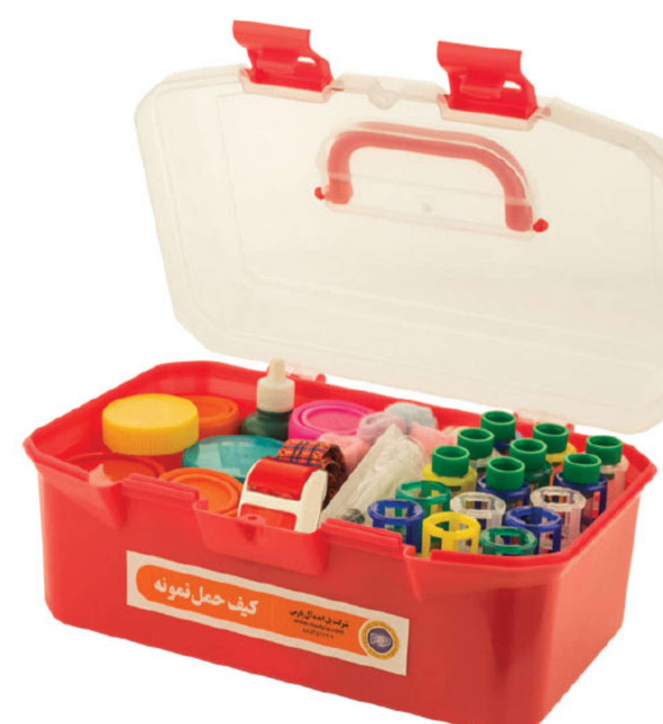
Sample Collection and Transportation Case (page 73)