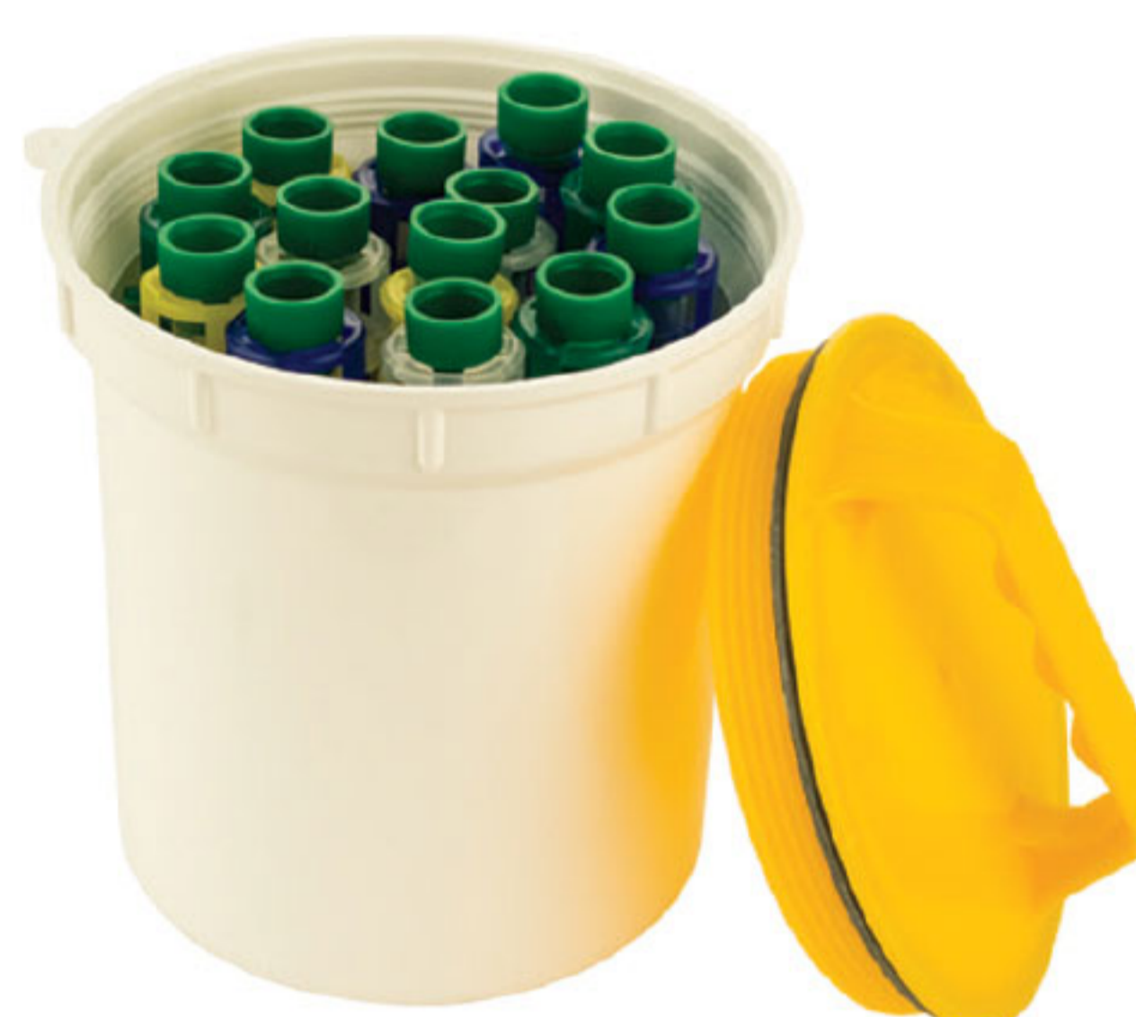
Biojar (page 66)